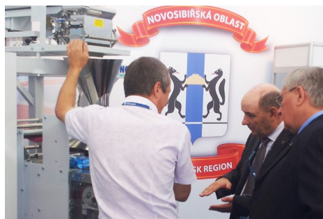
At the exhibition in Brno, Czech Republic – 2012