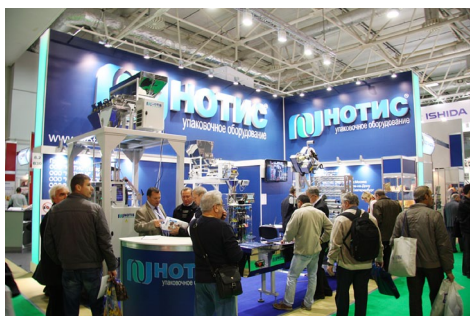
At the exhibition in Moscow, Russia – 2014